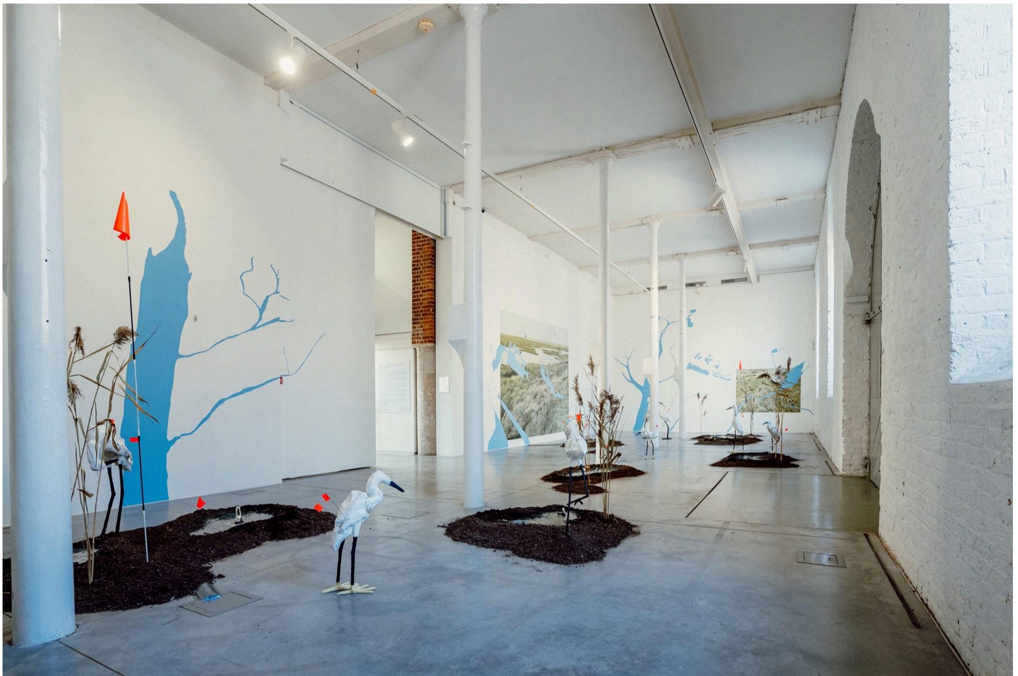
Sink or Float : An Artificial Island (birds 60-120cm high 50-80cm wide, installation 20x6x4m) Steel, Fibreglass, Milliput, Pewter, Earth, Dried Reeds, Paint, Digital Print. 2022