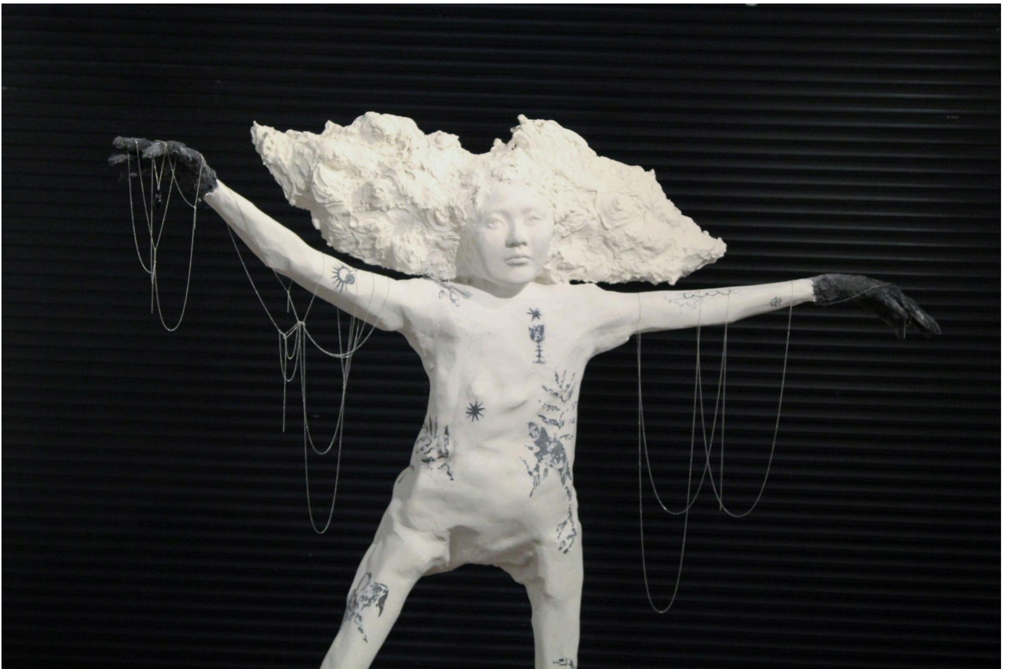
They flower into deadly nightshade (180x200x50cm) Jesmonite, steel, glass, ink. 2022