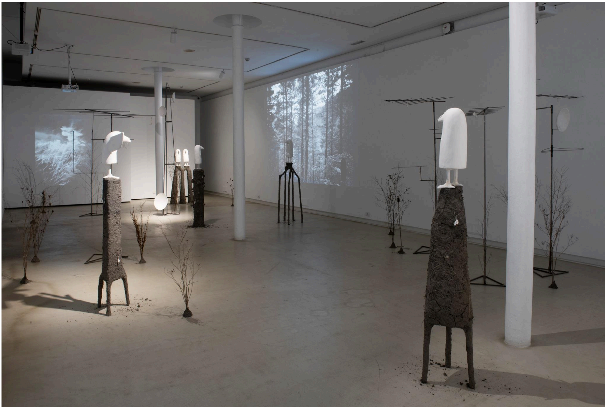
Tele.(gram) : Frequencies of the forest (installation 18x6x3m; birds 50x20x15cm) Steel, Plaster, Clay, Erath, Sand, Natural Fibres, Dried Plants, Projections, Digital Print. 2021