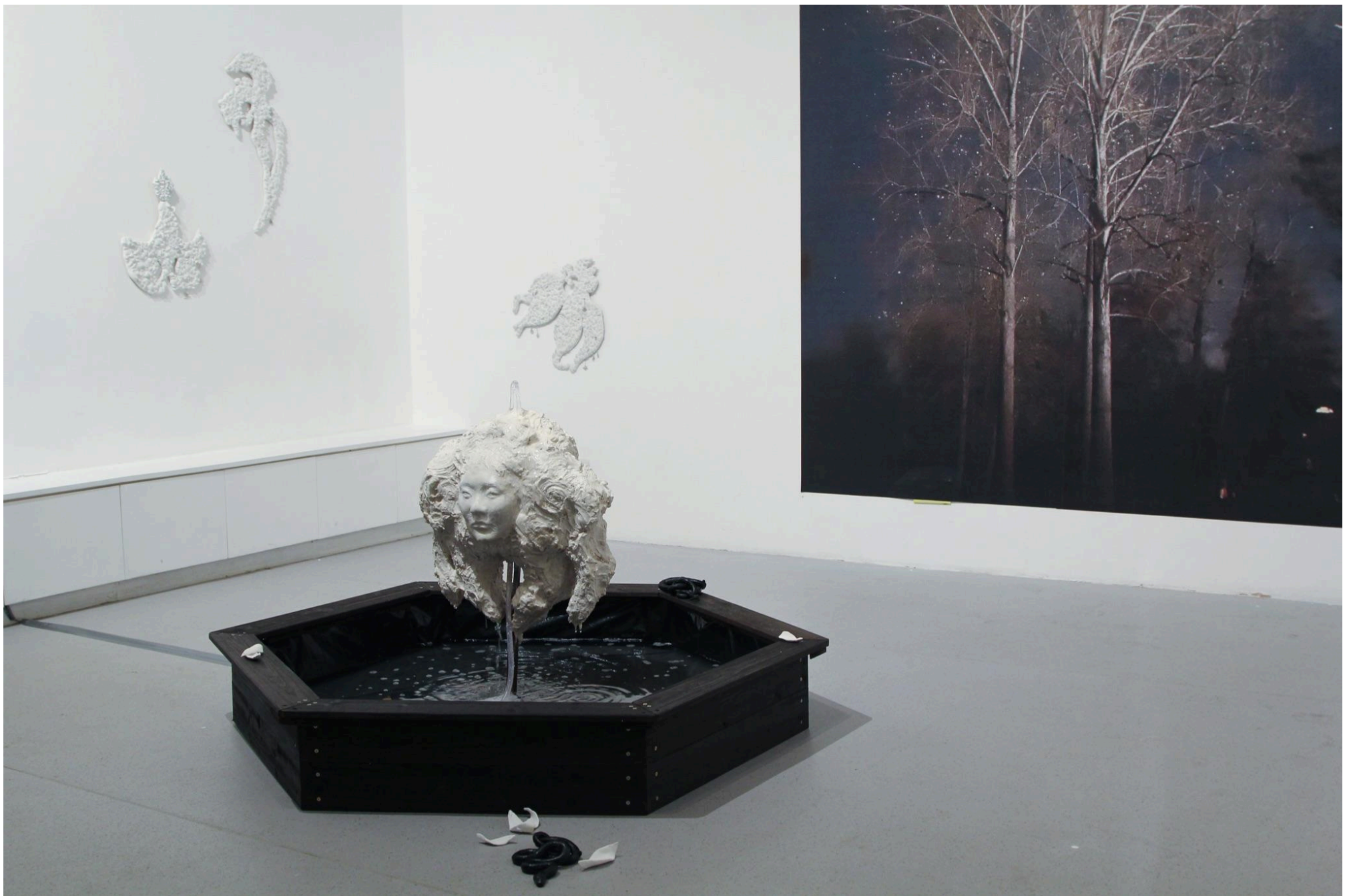
They flower into deadly nightshade (fountain 150x150x100cm, serpents 35x20x5cm, print 200x260cm, ghost I 60x50x3cm, room 1 installation 3 x3 m) Steel, Wood, ceramic, jesmonite, water, pvc, pump, stones, grout, pewter, Digital Print. 2022