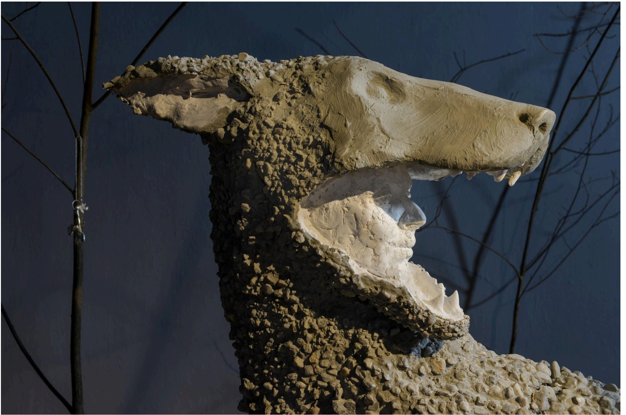
Detail of She Wolf - from exhibition When the Moon Howls