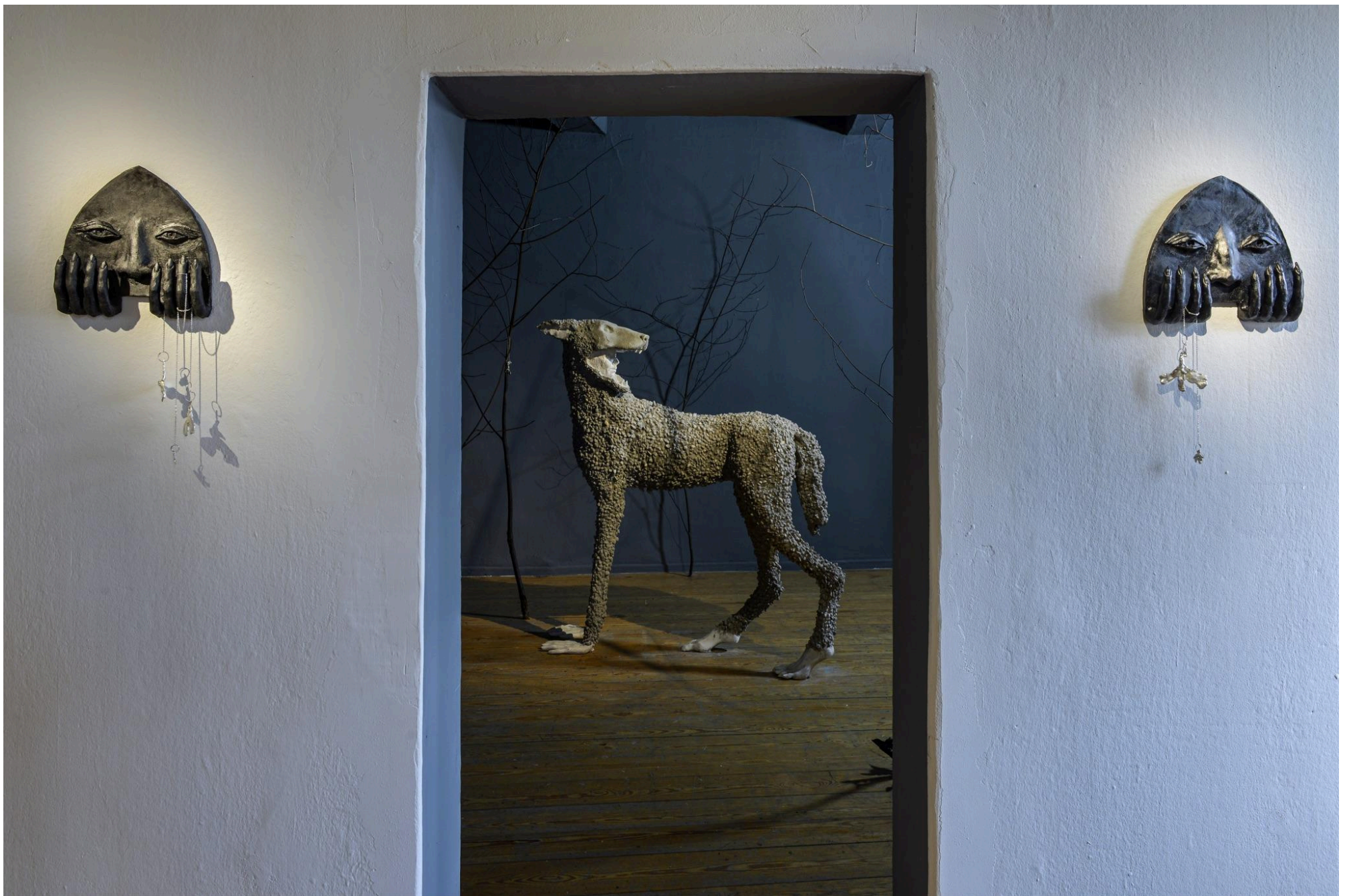
She Wolf - from exhibition When the Moon Howls

Polystyrene, steel, plaster, stone, grout, 2023