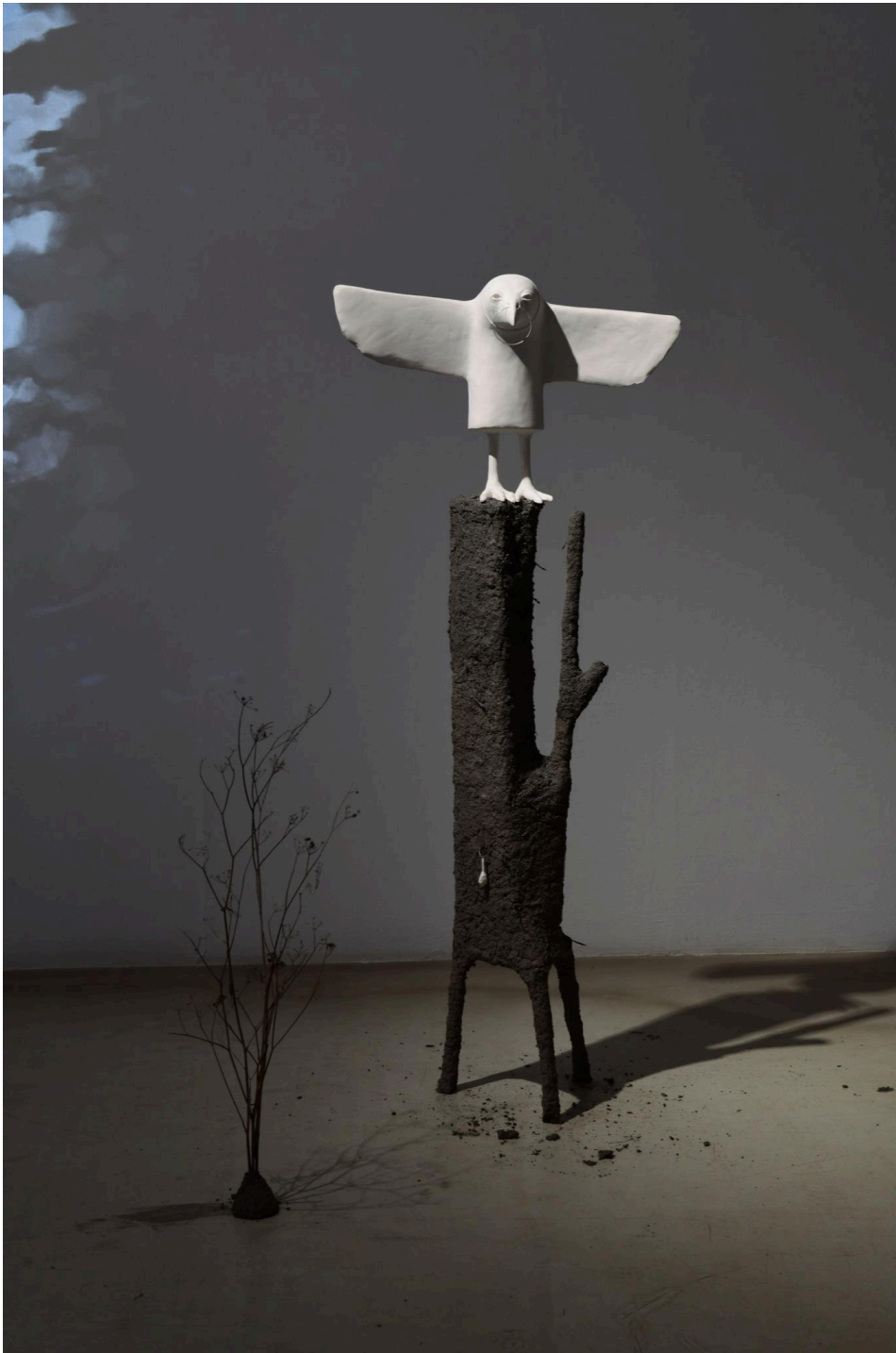
White Crow | Tele.(gram) : Frequencies of the forest (180 x 70 x 50 cm) Steel, Plaster, Clay, Earth, Sand, Natural Fibres, Dried Plants. 2021