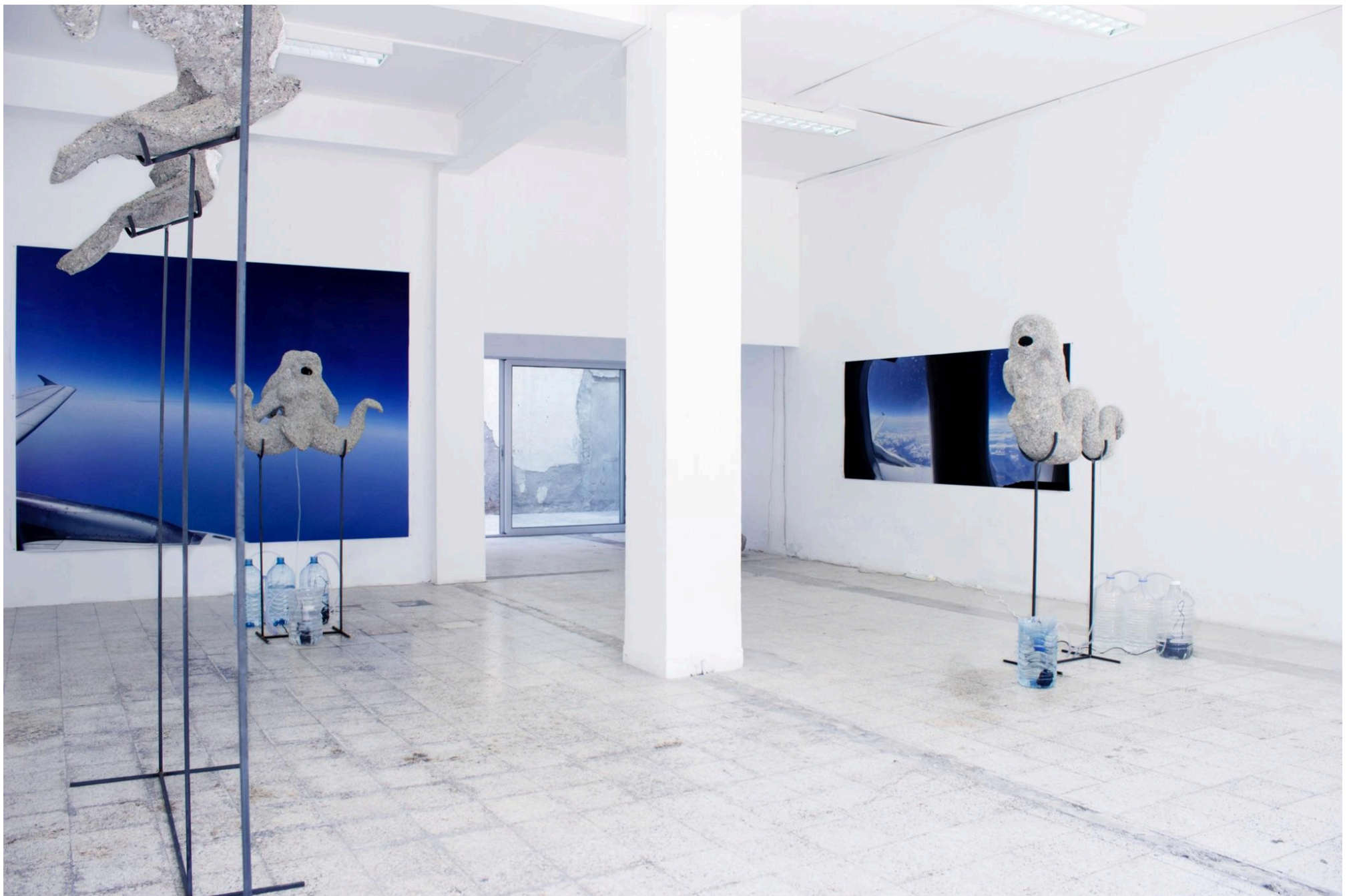
Song of the Siren, (installation 6 x 4 x 10m)

Paper Pulp, steel, plastic bottles, pvc, water pump, digital print. 2022