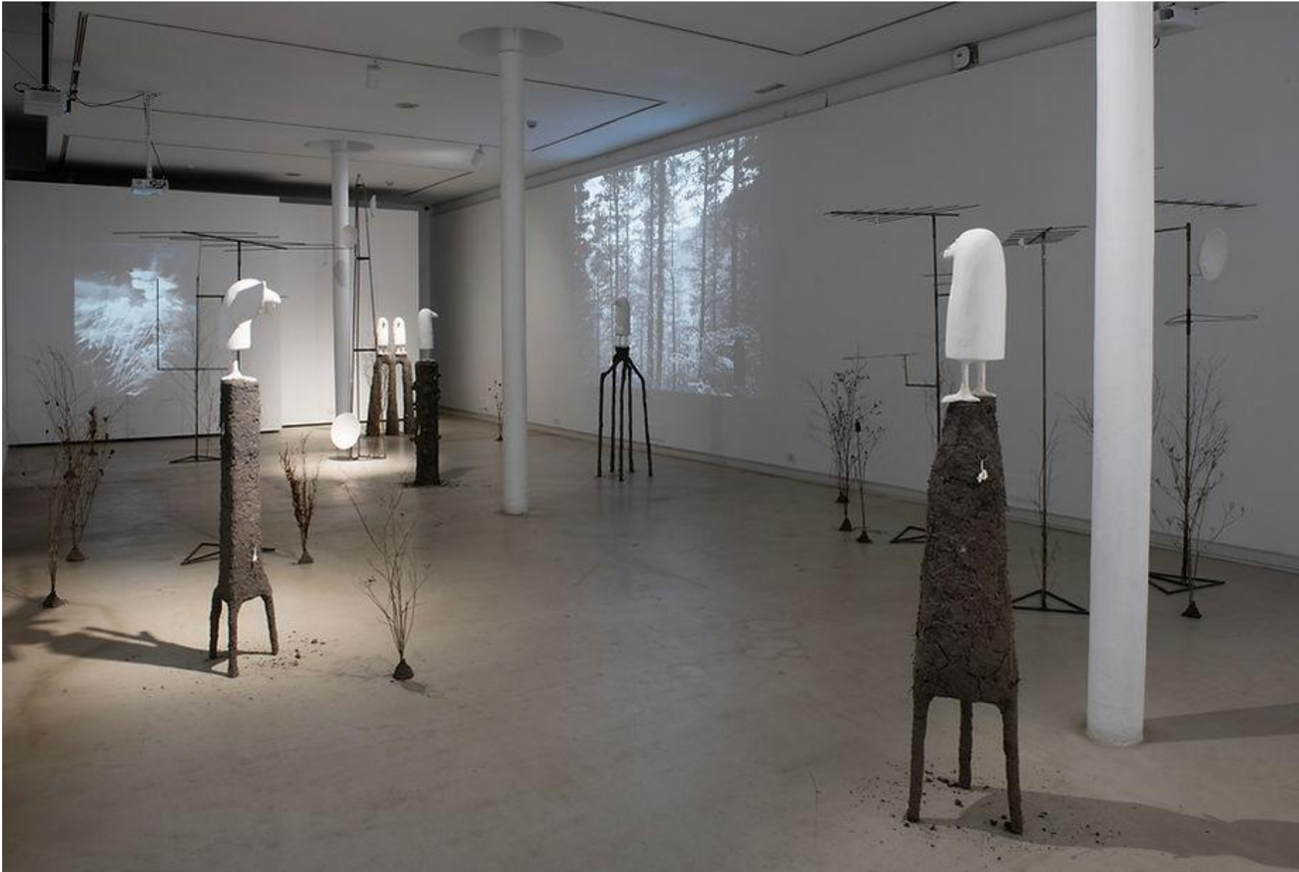
Tele.(gram) : Frequencies of the forest (installation 18x6x3m; birds 50x20x15cm)

Steel, Plaster, Clay, Erath, Sand, Natural Fibres, Dried Plants, Projections, Digital Print. 2021