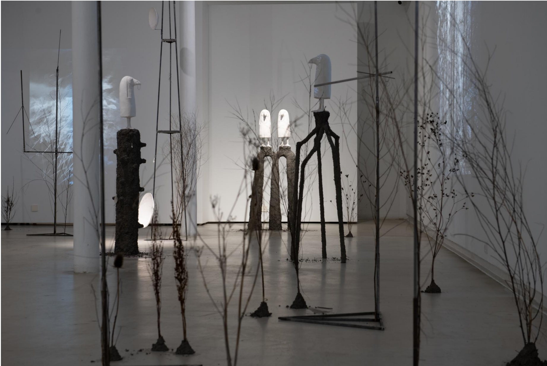
Tele.(gram) : Frequencies of the forest (installation 18x6x3m; birds 50x20x15cm) Steel, Plaster, Clay, Erath, Sand, Natural Fibres, Dried Plants, Projections, Digital Print. 2021