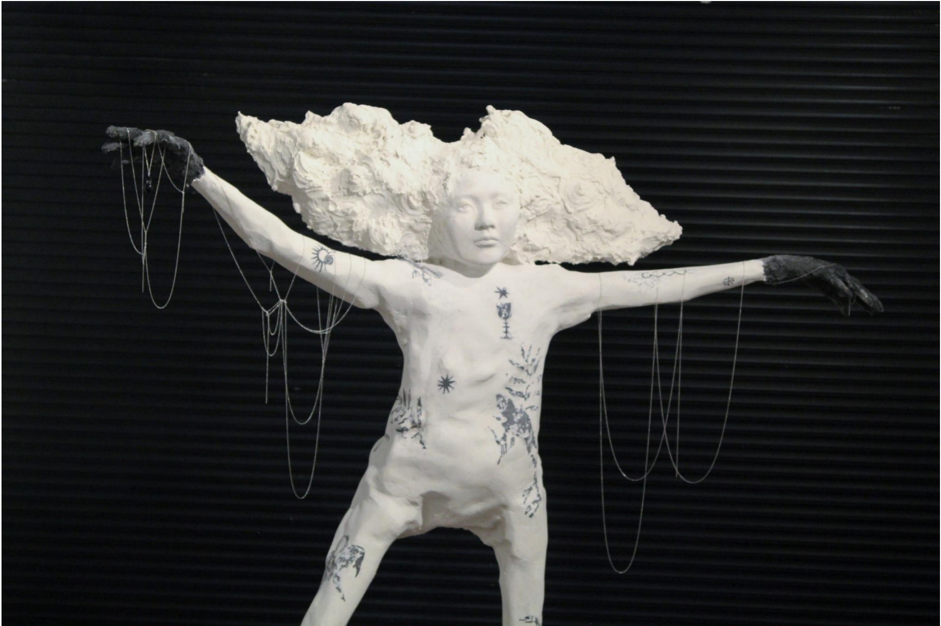
They flower into deadly nightshade (180x200x50cm)