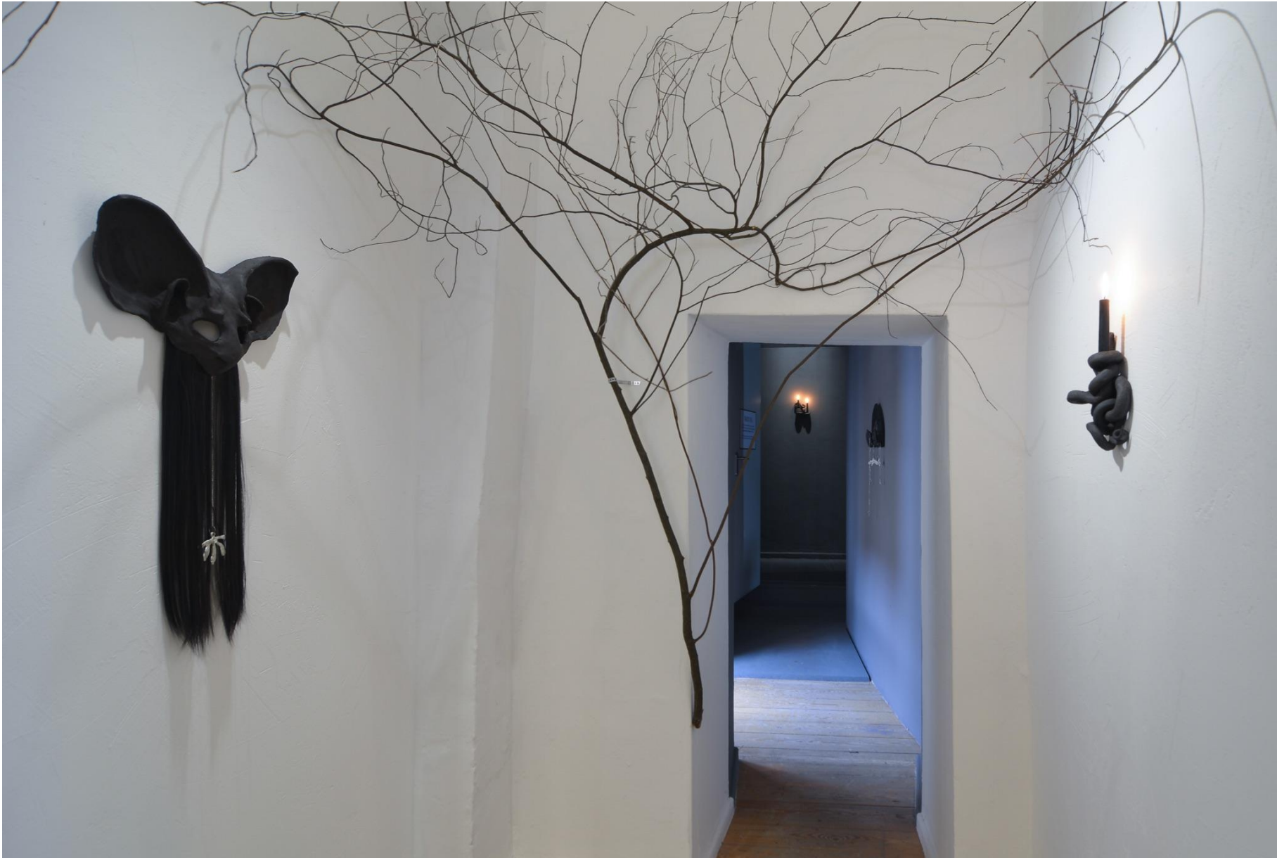
When The Moon Howls : Mask (100 x 80 x 30cm) | Serpent Candelabra (30 x 20 x 10cm) Ceramic, Pewter, Synthetic Hair. 2023 | Ceramic, Wax. 2023