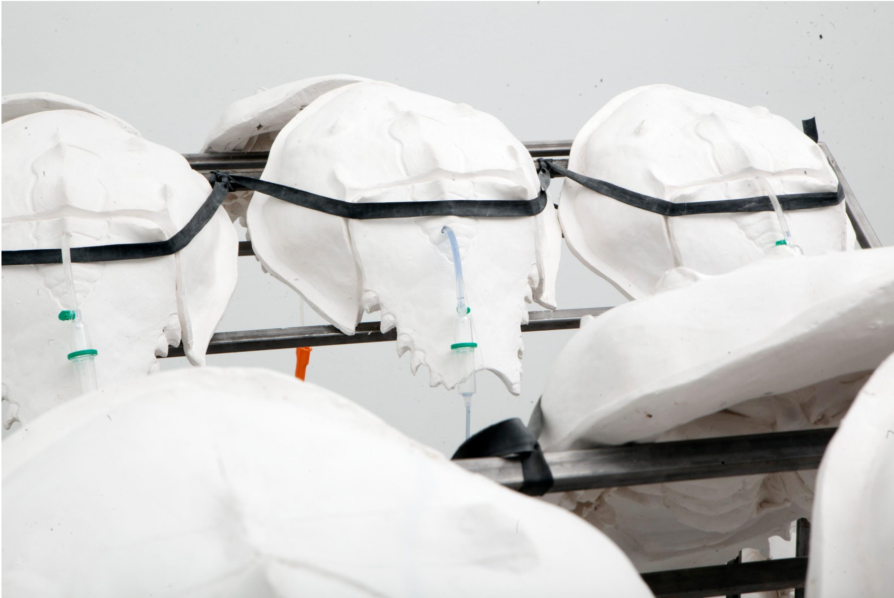
Ghosts in the Fridge (detail of horseshoe crabs 40x55x20cm each)

Plaster, pvc, rubber, plastic, polystyrene, water, dye 2020