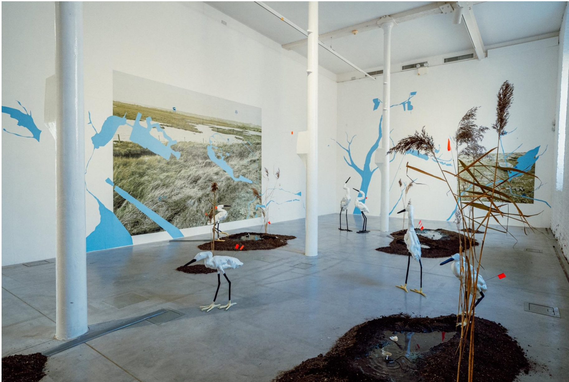
Sink or Float : An Artificial Island (birds 60-120cm high 50-80cm wide, installation 20x6x4m)

Steel, Fibreglass, Milliput, Pewter, Earth, Dried Reeds, Paint, Digital Print. 2022