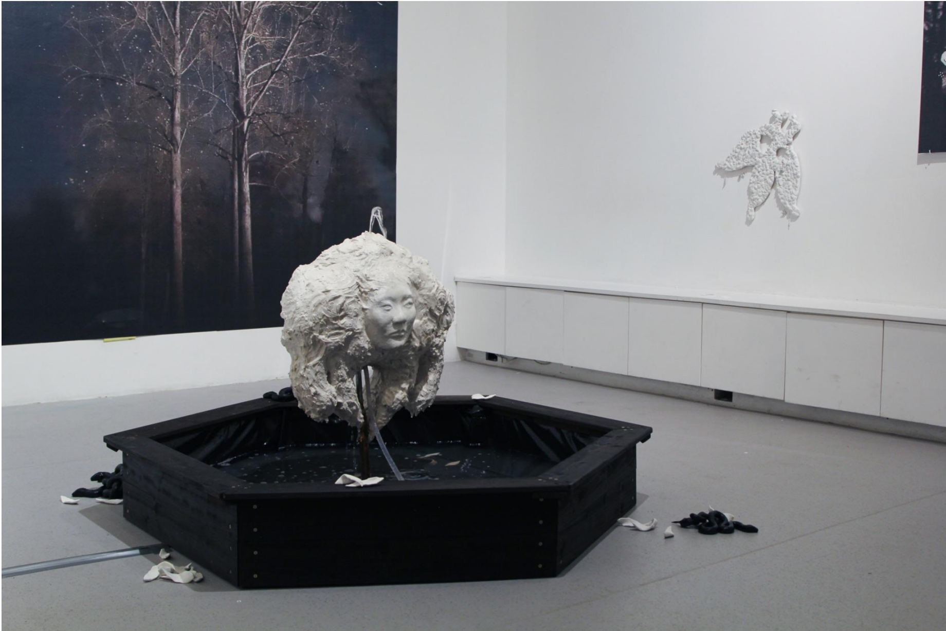
They flower into deadly nightshade (fountain 150x150x100cm, serpents 35x20x5cm, print 200x260cm, ghost I 60x50x3cm, room 1 installation 3 x3 m)

Steel, Wood, ceramic, jesmonite, water, pvc, pump, stones, grout, pewter, Digital Print. 2022